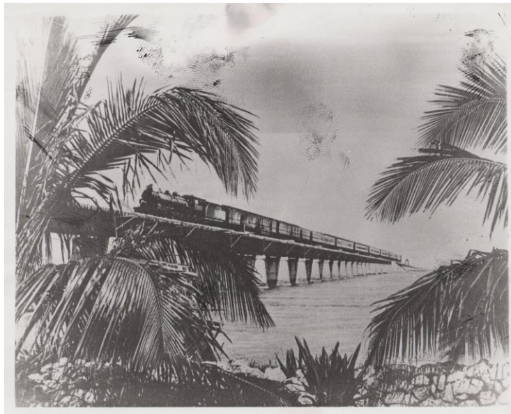
Black and white photograph of a Florida East Coast Railway train crossing the Seven Mile Bridge. Photograph taken from Pigeon Key.