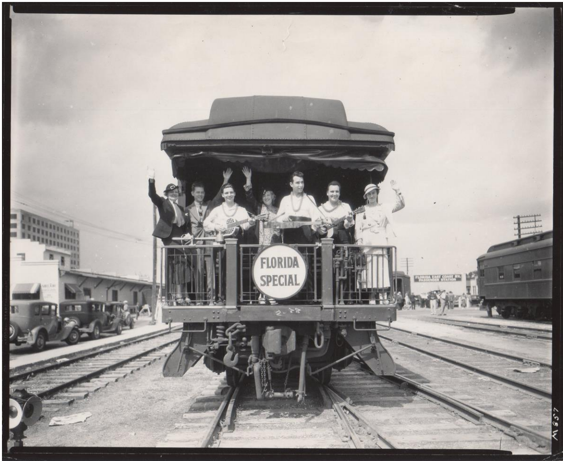
Black and white photograph of musicians and passengers at the rear of the Florida Special train at the Miami East Coast Railroad passenger station.