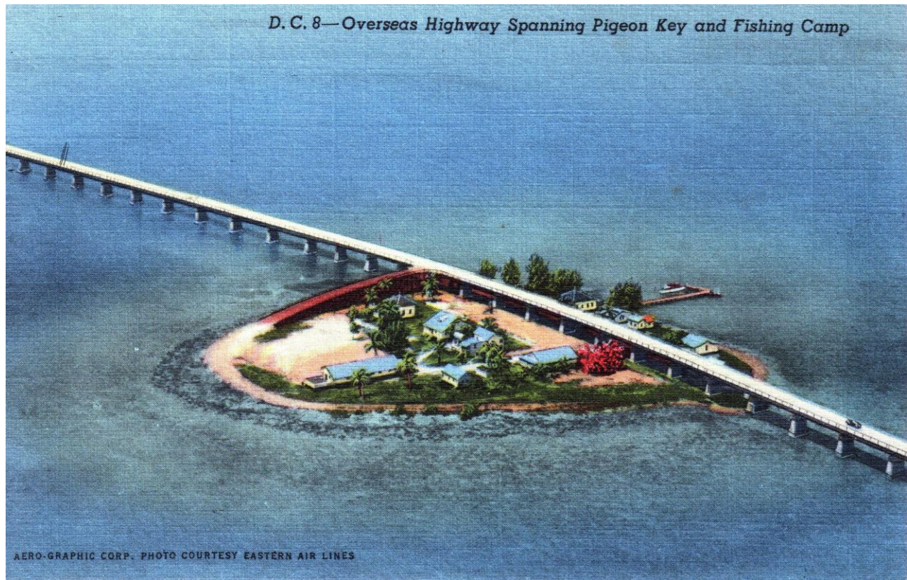
Postcard depicting the Overseas Highway above Pigeon Key. The caption reads, 'Overseas Highway spanning Pigeon Key and Fishing Camp'. The description on the verso reads, 'The longest span of the Overseas Highway is the seven mile portion which spans Pigeon Key. On this small island about midway between Miami and Key West, is located a popular fishing camp.'