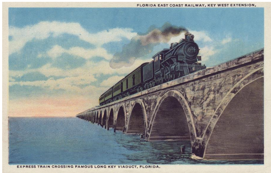
Postcard depicting an Overseas Railway train on Long Key Viaduct. The caption reads, 'Florida East Coast Railway Key West Extension, Express Train Crossing Famous Long Key Viaduct, Florida'.