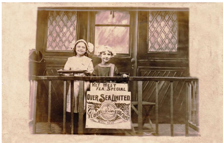
Postcard depicting two girls on the back of an Overseas Railway train car with a sign that reads, 'Key West, Florida Special, Over Sea Limited, Florida East Coast Railway'.