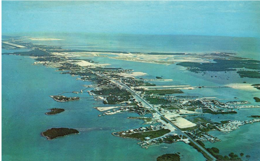
Aerial View of Marathon Key, Florida.