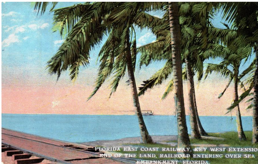
Postcard depicting the Overseas Railway at the entrance to a bridge. The caption reads, 'Florida East Coast Railway, Key West, Extension, end of the land, railroad entering over sea embankment, Florida'.